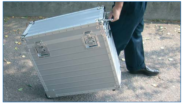
BER 3 - Heavy Duty Transport Case