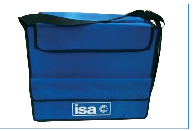
BER 3 - Plastic Carry Bag